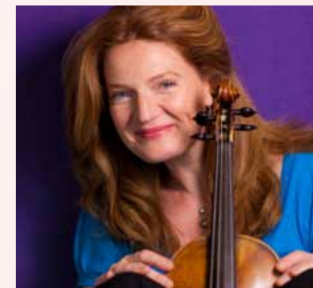
Rachel Podger