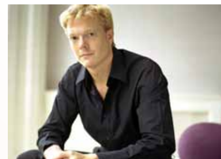
Toby Spence: © Mitch Jenkins

Saturday 9 July 19.30 The Dream of Gerontius St Albans Cathedral