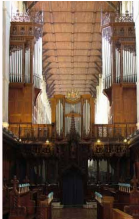
St Albans Cathedral Organ Case