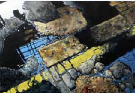
© Mick Dean: Road to the Olympics