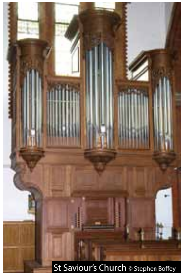
St Saviour's Church