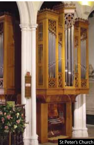
St Peter's Church