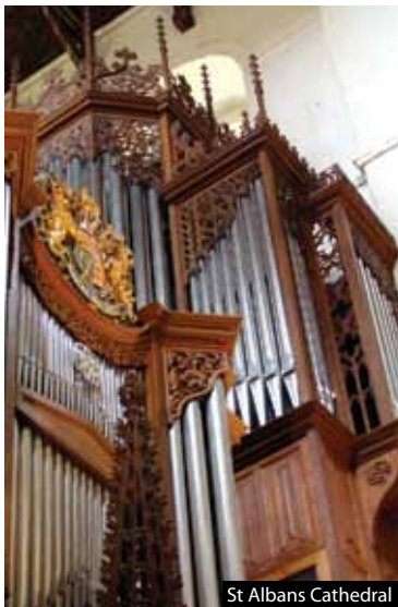
St Albans Cathedral